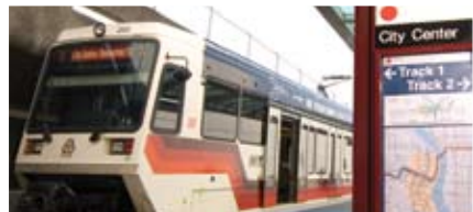
In 2001, the Red Line made airport travel easier.