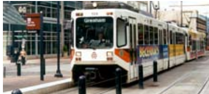
MAX connected Gresham and Portland in 1986.