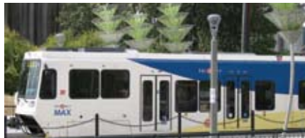
MAX began serving N/NE Portland in 2004.