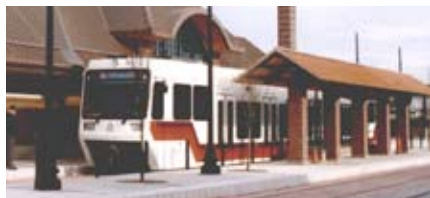
An extension to Hillsboro opened in 1998.