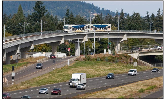
A MAX train travels south to Clackamas Town Center Transit Center on the Johnson Creek Blvd. overpass along Interstate 205.

In 1983, the completion of the northern portion of Interstate 205 included a transitway parallel to much of the highway as it passed through Multnomah County. Meanwhile, the Portland Mall opened in 1978, providing bus service with a dedicated alignment on several blocks of 5th and 6th avenues in downtown Portland.