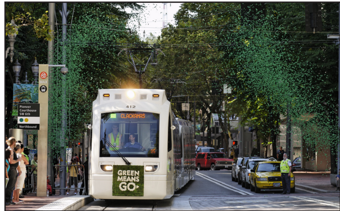
The first MAX Green Line train is welcomed by crowds and confetti at Pioneer Courthouse on September 12, 2009.

Project construction on the Mall alignment took place in the heart of the region's central business district, and innovative methods were employed to minimize disruptions to businesses. Project efforts included one-on-one support for businesses and property owners, encouragement to buy goods and services downtown, a project website that tracked construction progress and weekly construction updates sent via email to downtown businesses, property owners and residents.