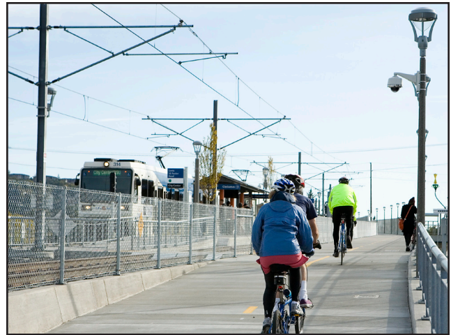
Cyclists ride along the I-205 multi-use path through the Lents Town Center/SE Foster Rd MAX Station.

To address this need, TriMet and the Portland Development Commission (PDC) created the Block By Block (BBB) program in 2006, an innovative example of a public-private partnership. BBB employed financing assistance, design consultation and city facilitation tools to encourage private investment in façade improvements. The program approached property owners and business along the 117 block faces on 5th and 6th avenues between SW Jackson and NW Irving streets. As of August 2009, the BBB program realized a $9.10 private sector investment for every $1 granted from PDC. For a number of projects,