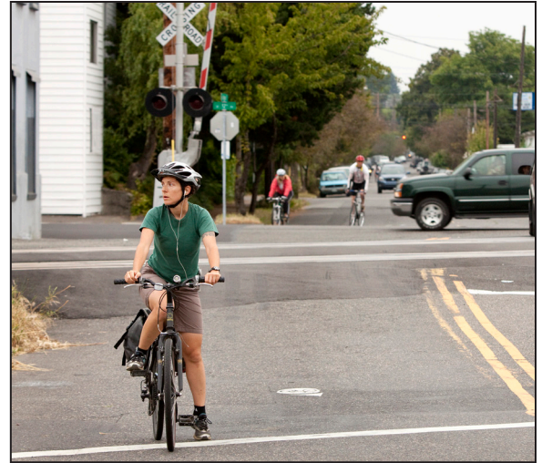
A new multi-use path will parallel light rail tracks between SE 11th and SE 8th avenues (left). There are poor connections to major bicycle and pedestrian corridors in the area.

of Powell Boulevard will be modified to improve safety for cyclists and pedestrians by providing an accessible route with an extended sidewalk, better lighting and a more open feel. The west half of the south sidewalk will also be improved.